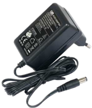
24 V 1.2 A power adapter