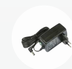
24V 1.2A Adapter