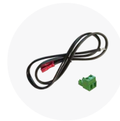
Battery DC wire with T2 Tab terminal (also fits T1)