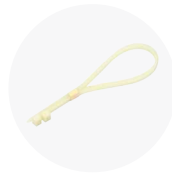
Plastic zip tie