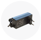
24 V 1.5 A Power adapter